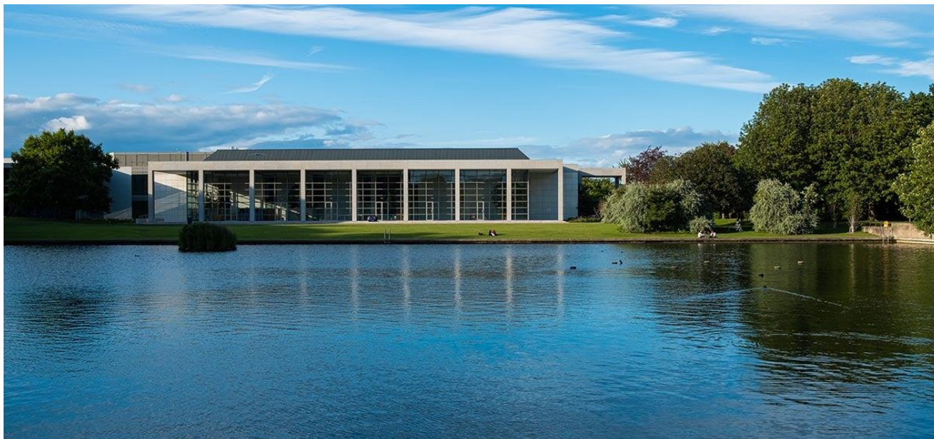
UCD O'Reilly Hall

The meeting will be taking place in the O'Reilly Hall, University College Dublin, Belfield, Dublin, located roughly 7km south of Dublin City centre.